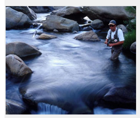
Fly fishing in the Kern River.

The deployment began with a pilot project in the Lamont regional court, chosen for its smaller size and lower case volume. The court freed up space, improved file accessibility and provided better service, proving that Laserfiche could meet the needs of Kern County's other courts. Best of all, judges were comfortable with the solution—once they realized that files, in St. Laurent's words, "were not going to disappear into the ether."